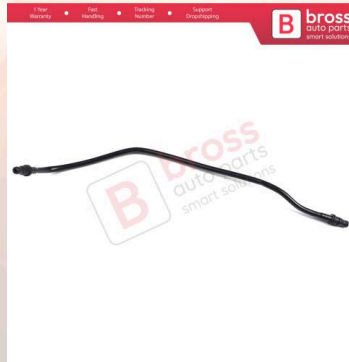
BHC662 Engine Coolant Overflow Hose Vent Tube Breather Pipe 2115010125 for Mercedes W211 E 500 C219 CLS 500 M113.967 Engine