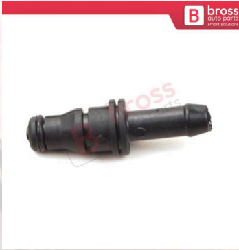
BHC632 Coolant Breather Hose Pipe Socket A0039970689 for Mercedes W203 W221 C230 S400 S550 S600