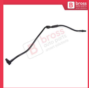
BHC663 Engine Coolant Overflow Hose Vent Tube Breather Pipe 2115011625 for Mercedes W211 E63 AMG C219 CLS63 AMG M156 6.2 L Engine