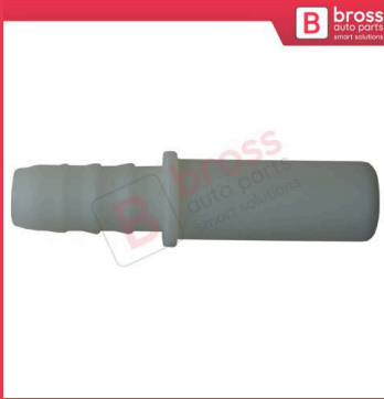
BHC651 Brake Booster Vacuum Hose 2024304629 Repair Part for Mercedes C W202 CLK430