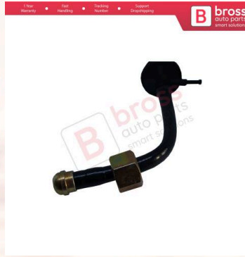
BHC646 Brake Booster Valve With Hose 564609 90497004 For Opel Vauxhall Vectra B 2.0