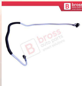
BHC638 Diesel Engine Fuel Hose Pipe Line 6110702932 for Mercedes C E V Class Sprinter Vito 638