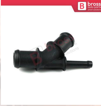
BHC654 Engine Coolant Tee Distributor Hose Connector Water Flange Connection 1J0121087D for VW Audi Seat Skoda