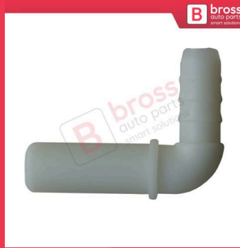
BHC652 Brake Booster Line 2034305129 Repair Part for Mercedes C Class W203 S203 CLK C209 A209