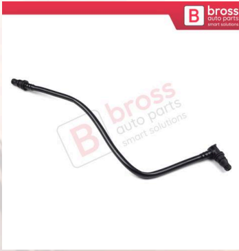
BHC660 Engine Coolant Overflow Hose Vent Tube Breather Pipe 2115010925 for Mercedes W211 C219 S211