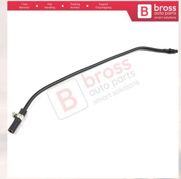
BHC664 Engine Coolant Overflow Hose Vent Tube Breather Pipe 2115011525 for Mercedes E Class W211 OM646 2.1 D