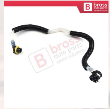
BHC636 Diesel Fuel Line Pipe A6110706832 From Filter To Pump for Mercedes Benz Sprinter Vito