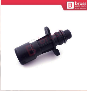
BHC653 Engine Oil Cooler Line Inlet Connector Tube Hose LR028136 for Land Rover Sport LR4 Range Rover