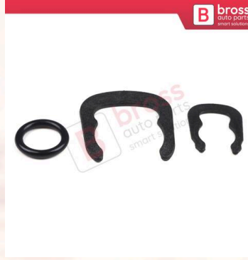
BHC659 Thermostat Temperature Sensor Seal Liner Coolant Hose Retaining Spring 032121142A for VW Audi Seat Skoda