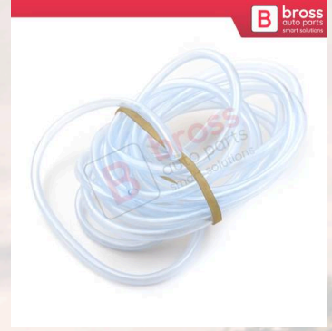
BHC644 3 Meters Windscreen Washer Jet Hose Tube Screen Water Pump 4mm Hose Pipe