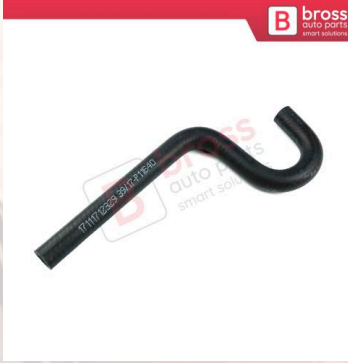
BHC22 Radiator Overflow Fitting Engine Coolant Water Line Pipe Hose 17111712329 for BMW