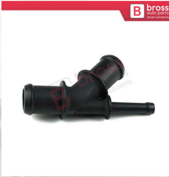
BHC654 Engine Coolant Tee Distributor Hose Connector Water Flange Connection 1J0121087D for VW Audi Seat Skoda