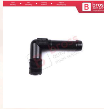
BHC647 Thermostat Pipe 1338331R for Opel Vauxhall Astra G Vectra B Zafira A 1.4-1.6 16V