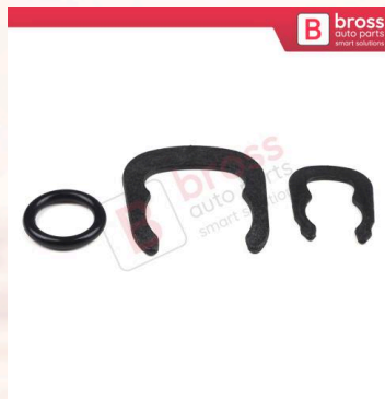
BHC659 Thermostat Temperature Sensor Seal Liner Coolant Hose Retaining Spring 032121142A for VW Audi Seat Skoda