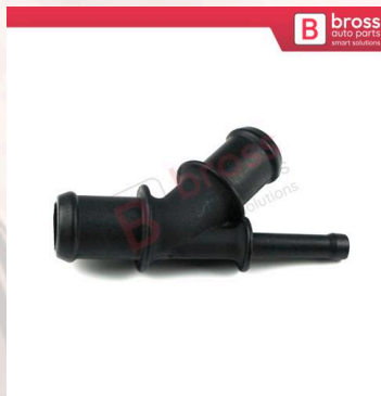
BHC654 Engine Coolant Tee Distributor Hose Connector Water Flange Connection 1J0121087D for VW Audi Seat Skoda