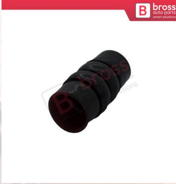
BHC650 Turbo Charger Intake Air Hose 5T166N650AB for Ford Connect Fiesta Focus Turnier