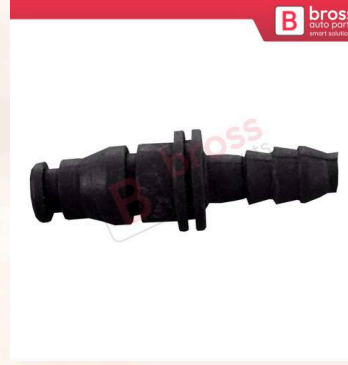
BHC633 Universal Expansion Tank Coolant Hose Connector