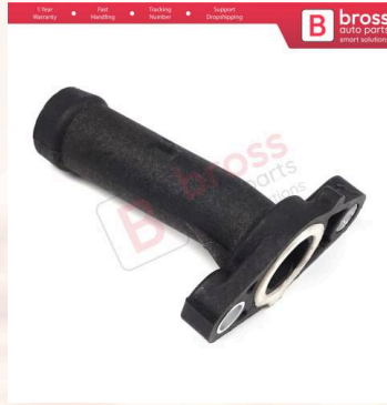
BHC657 Engine Coolant Water Flange Socket 03H121145A for Audi Q7 VW EOS CC Passat Touareg Porsche Cayenne Skoda Superb