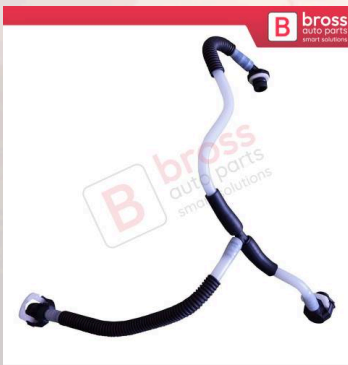
BHC637 3 Way Fuel Pipe to Pump 6110707632 for Mercedes Benz Sprinter Diesel 2000- 2006