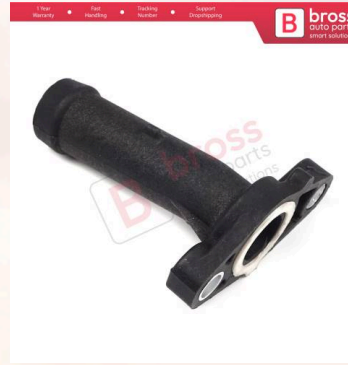
BHC657 Engine Coolant Water Flange Socket 03H121145A for Audi Q7 VW EOS CC Passat Touareg Porsche Cayenne Skoda Superb