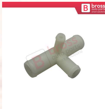
BHC643 Coolant Flange 4 Way Hose 7705030158 for Renault 11 21 9