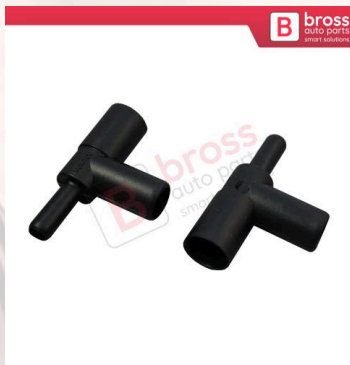
BHC642 2 Pieces Carburetor Distribution 3 Way Hose 7705030125 for Renault 9 11