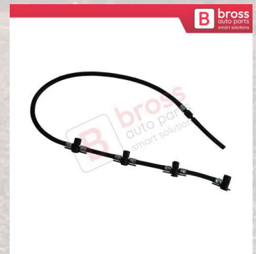
BHC649 Fuel Overflow Hose A6460700932 for Mercedes Sprinter 2.2 CDI