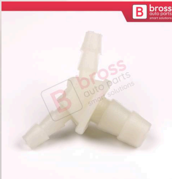
BHC658 Cylinder Crankcase Oil Breathing Pressure Reducing Valve Connector 1110180009 for Mercedes Ssang Yong