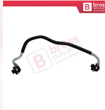
BHC635 Diesel Fuel Line Pipe 6110702032 From Filter To Pump for Mercedes Benz Sprinter Vito