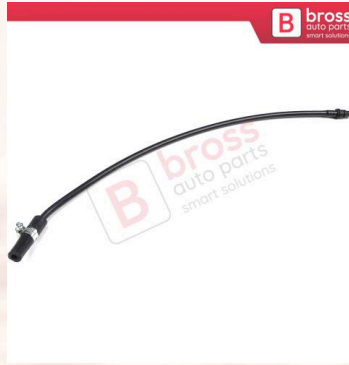
BHC661 Engine Coolant Overflow Hose Vent Tube Breather Pipe 2115010225 for Mercedes E Class W211 OM646 Engine