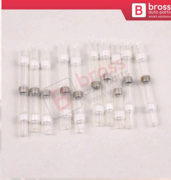
BHC500 10 Pieces Heat Shrinkable Crimp Solder Sleeves Butt Connectors for 01 05 mm 2 Cable Transparent White Lenght24 mm