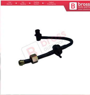
BHC645 Brake Booster Valve With Hose 564611 90498464 For Opel Vauxhall