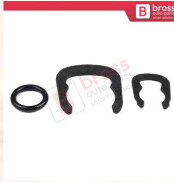
BHC659 Thermostat Temperature Sensor Seal Liner Coolant Hose Retaining Spring 032121142A for VW Audi Seat Skoda