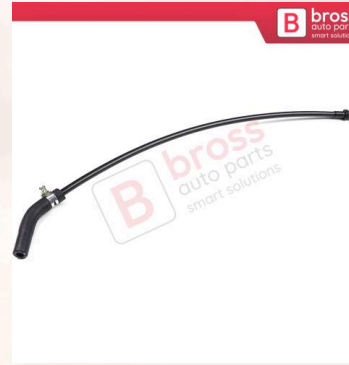
BHC665 Engine Coolant Overflow Hose Vent Tube Breather Pipe 2115011525 for Mercedes E Class W211 E320 E280 OM648 Engine 3.2 D