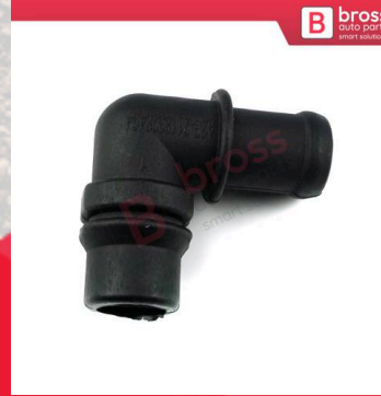
BHC655 HVAC Air Conditioner Heater Hose Connector 2038300596 for Mercedes W203 A203 C203 CL203 CLK203