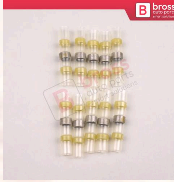
BHC503 10 Pieces Heat Shrinkable Crimp Solder Sleeves Butt Connectors for 40 60 mm 2 Cable Transparent Yellow. Lenght39 mm