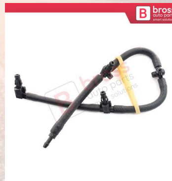
BHC640 Injector Fuel Leak Off Line Pipe 6510702432 for Mercedes Sprinter Vito Viano W639