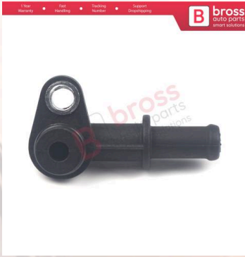
BHC656 Water Cooling Alternator Hose Connection Piece Generator Neck Flange Bypass Line Adapter 94810646200 for Porsche Cayenne Panamera