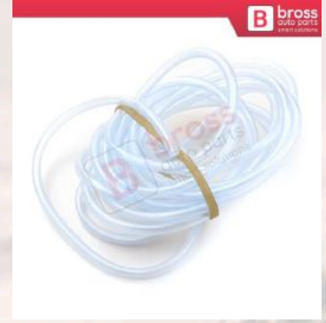
BHC644 3 Meters Windscreen Washer Jet Hose Tube Screen Water Pump 4mm Hose Pipe