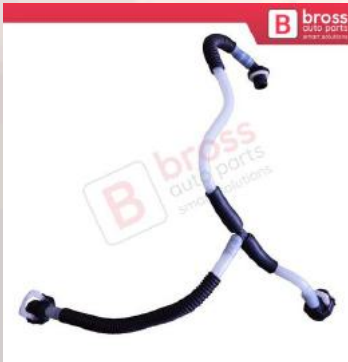
BHC637 3 Way Fuel Pipe to Pump 6110707632 for Mercedes Benz Sprinter Diesel 2000- 2006