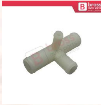
BHC643 Coolant Flange 4 Way Hose 7705030158 for Renault 11 21 9