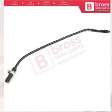
BHC664 Engine Coolant Overflow Hose Vent Tube Breather Pipe 2115011525 for Mercedes E Class W211 OM646 2.1 D