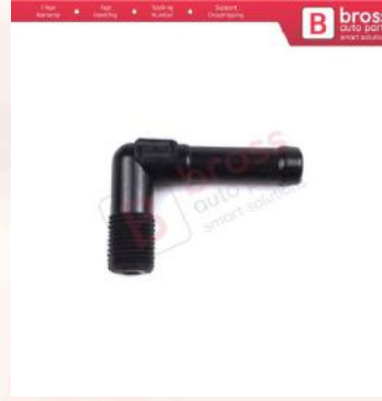
BHC647 Thermostat Pipe 1338331R for Opel Vauxhall Astra G Vectra B Zafira A 1.4-1.6 16V