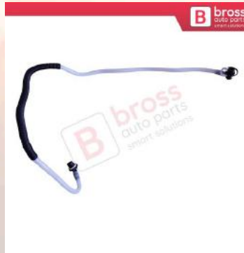
BHC638 Diesel Engine Fuel Hose Pipe Line 6110702932 for Mercedes C E V Class Sprinter Vito 638