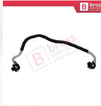
BHC635 Diesel Fuel Line Pipe 6110702032 From Filter To Pump for Mercedes Benz Sprinter Vito