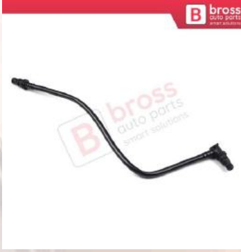
BHC660 Engine Coolant Overflow Hose Vent Tube Breather Pipe 2115010925 for Mercedes W211 C219 S211