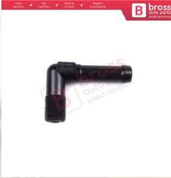
BHC647 Thermostat Pipe 1338331R for Opel Vauxhall Astra G Vectra B Zafira A 1.4-1.6 16V