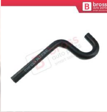
BHC22 Radiator Overflow Fitting Engine Coolant Water Line Pipe Hose 17111712329 for BMW