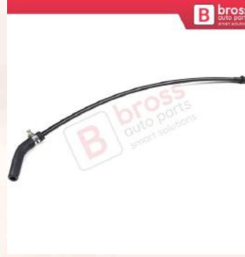
BHC665 Engine Coolant Overflow Hose Vent Tube Breather Pipe 2115011525 for Mercedes E Class W211 E320 E280 OM648 Engine 3.2 D