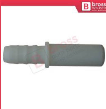
BHC651 Brake Booster Vacuum Hose 2024304629 Repair Part for Mercedes C W202 CLK430