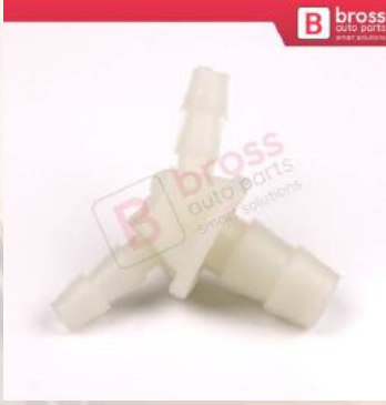
BHC658 Cylinder Crankcase Oil Breathing Pressure Reducing Valve Connector 1110180009 for Mercedes Ssang Yong