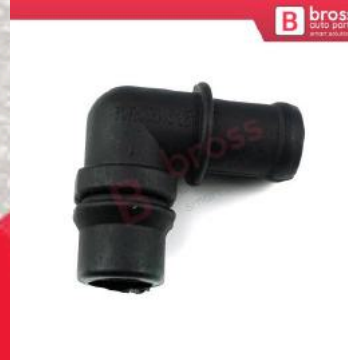
BHC655 HVAC Air Conditioner Heater Hose Connector 2038300596 for Mercedes W203 A203 C203 CL203 CLK203