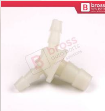
BHC658 Cylinder Crankcase Oil Breathing Pressure Reducing Valve Connector 1110180009 for Mercedes Ssang Yong