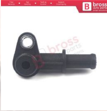
BHC656 Water Cooling Alternator Hose Connection Piece Generator Neck Flange Bypass Line Adapter 94810646200 for Porsche Cayenne Panamera