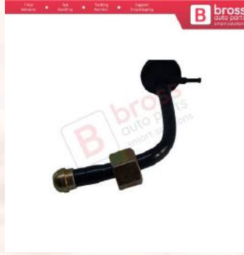
BHC646 Brake Booster Valve With Hose 564609 90497004 For Opel Vauxhall Vectra B 2.0