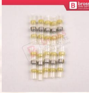
BHC503 10 Pieces Heat Shrinkable Crimp Solder Sleeves Butt Connectors for 40 60 mm 2 Cable Transparent Yellow. Lenght39 mm