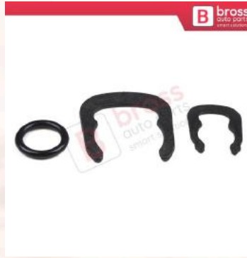
BHC659 Thermostat Temperature Sensor Seal Liner Coolant Hose Retaining Spring 032121142A for VW Audi Seat Skoda