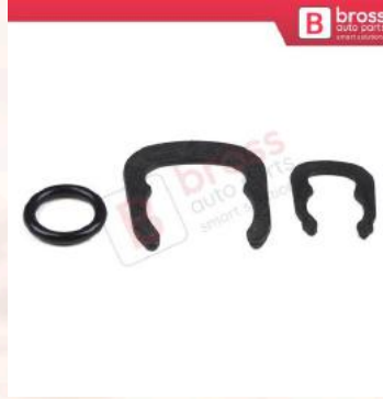
BHC659 Thermostat Temperature Sensor Seal Liner Coolant Hose Retaining Spring 032121142A for VW Audi Seat Skoda