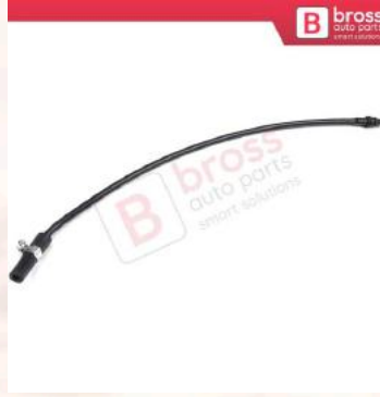
BHC661 Engine Coolant Overflow Hose Vent Tube Breather Pipe 2115010225 for Mercedes E Class W211 OM646 Engine