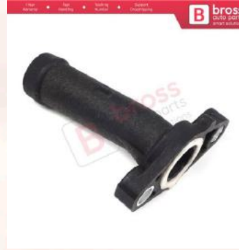
BHC657 Engine Coolant Water Flange Socket 03H121145A for Audi Q7 VW EOS CC Passat Touareg Porsche Cayenne Skoda Superb