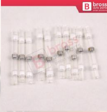
BHC500 10 Pieces Heat Shrinkable Crimp Solder Sleeves Butt Connectors for 01 05 mm 2 Cable Transparent White Lenght24 mm