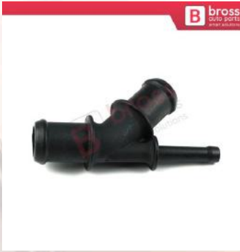
BHC654 Engine Coolant Tee Distributor Hose Connector Water Flange Connection 1J0121087D for VW Audi Seat Skoda