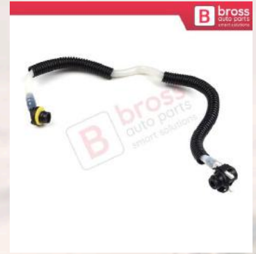
BHC636 Diesel Fuel Line Pipe A6110706832 From Filter To Pump for Mercedes Benz Sprinter Vito