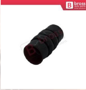
BHC650 Turbo Charger Intake Air Hose 5T166N650AB for Ford Connect Fiesta Focus Turnier