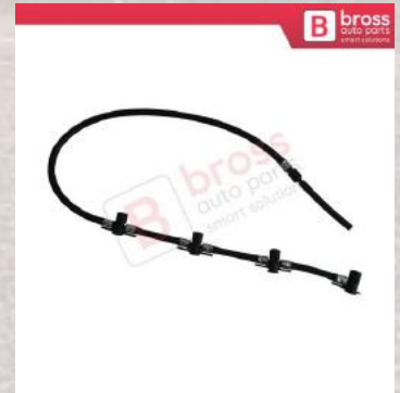
BHC649 Fuel Overflow Hose A6460700932 for Mercedes Sprinter 2.2 CDI