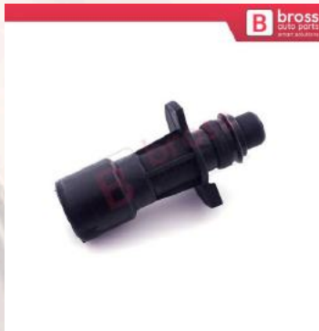
BHC653 Engine Oil Cooler Line Inlet Connector Tube Hose LR028136 for Land Rover Sport LR4 Range Rover