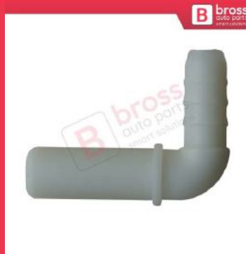
BHC652 Brake Booster Line 2034305129 Repair Part for Mercedes C Class W203 S203 CLK C209 A209