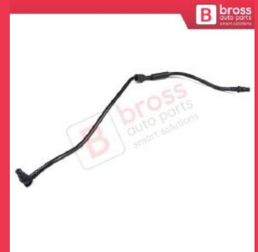
BHC663 Engine Coolant Overflow Hose Vent Tube Breather Pipe 2115011625 for Mercedes W211 E63 AMG C219 CLS63 AMG M156 6.2 L Engine