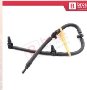
BHC640 Injector Fuel Leak Off Line Pipe 6510702432 for Mercedes Sprinter Vito Viano W639