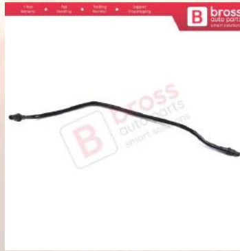
BHC662 Engine Coolant Overflow Hose Vent Tube Breather Pipe 2115010125 for Mercedes W211 E 500 C219 CLS 500 M113.967 Engine