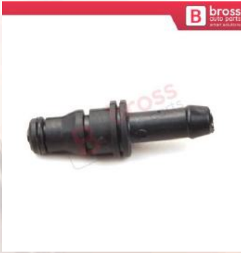
BHC632 Coolant Breather Hose Pipe Socket A0039970689 for Mercedes W203 W221 C230 S400 S550 S600