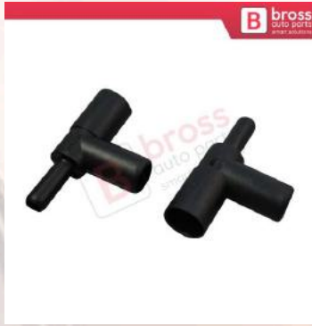
BHC642 2 Pieces Carburetor Distribution 3 Way Hose 7705030125 for Renault 9 11