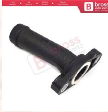
BHC657 Engine Coolant Water Flange Socket 03H121145A for Audi Q7 VW EOS CC Passat Touareg Porsche Cayenne Skoda Superb