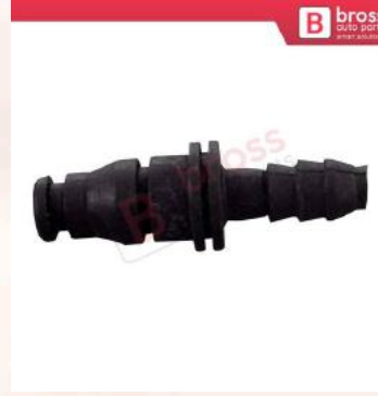
BHC633 Universal Expansion Tank Coolant Hose Connector