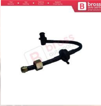
BHC645 Brake Booster Valve With Hose 564611 90498464 For Opel Vauxhall